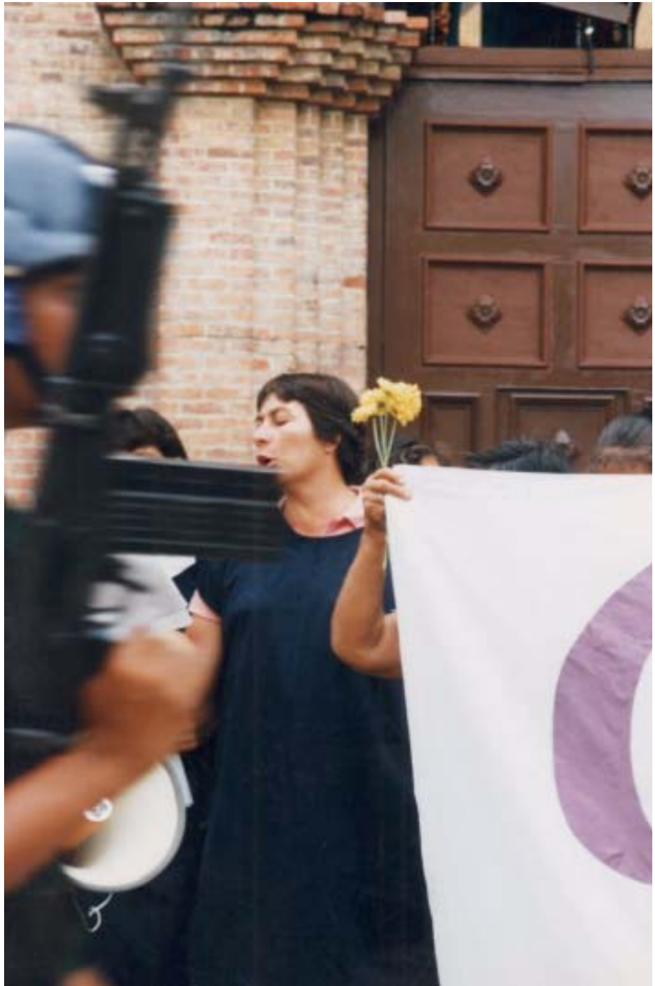
Colombian soldiers keep a close eye on a human rights demonstration organized by the Popular Women's Organization, 1998.