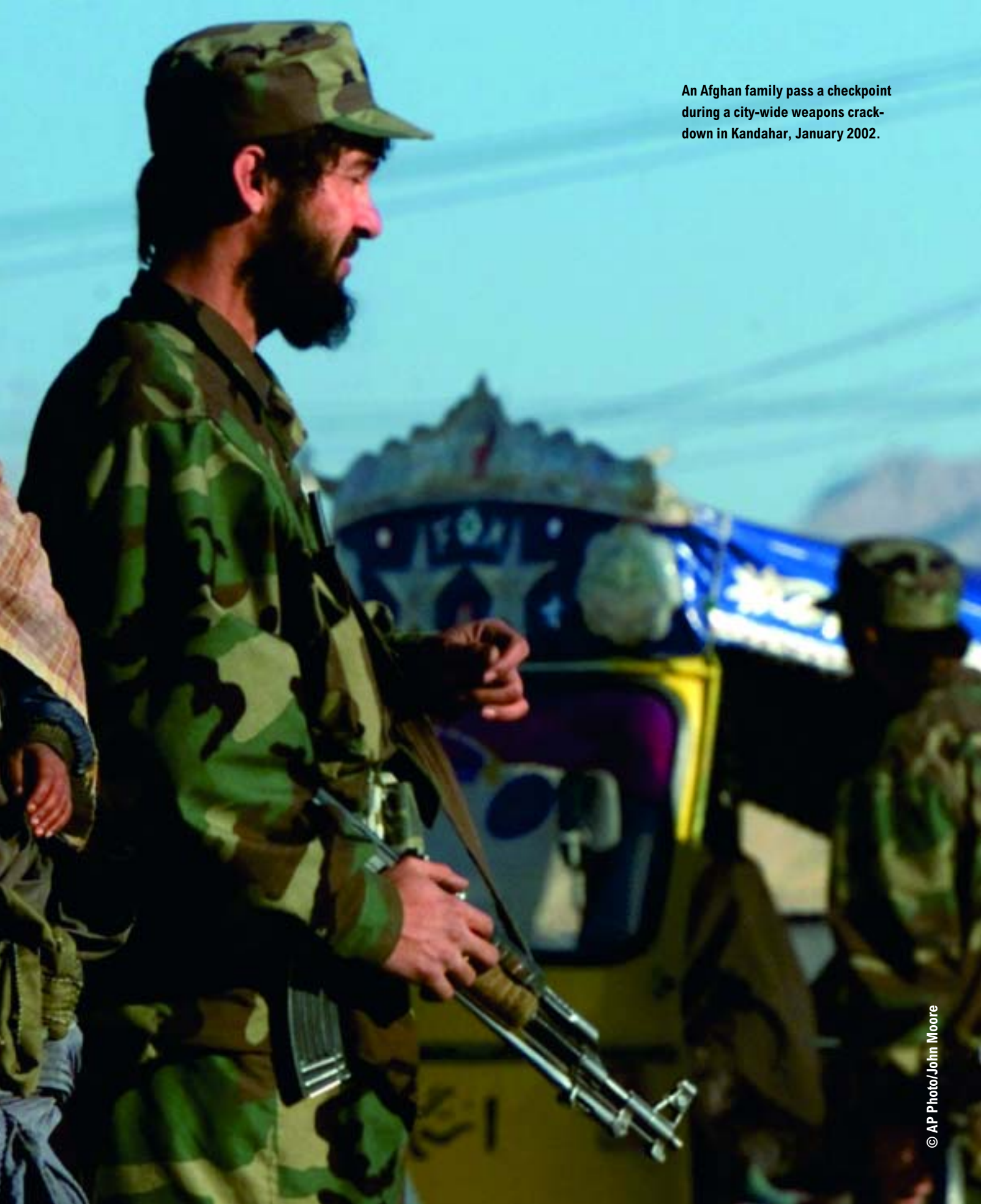
An Afghan family pass a checkpoint during a city-wide weapons crackdown in Kandahar, January 2002.